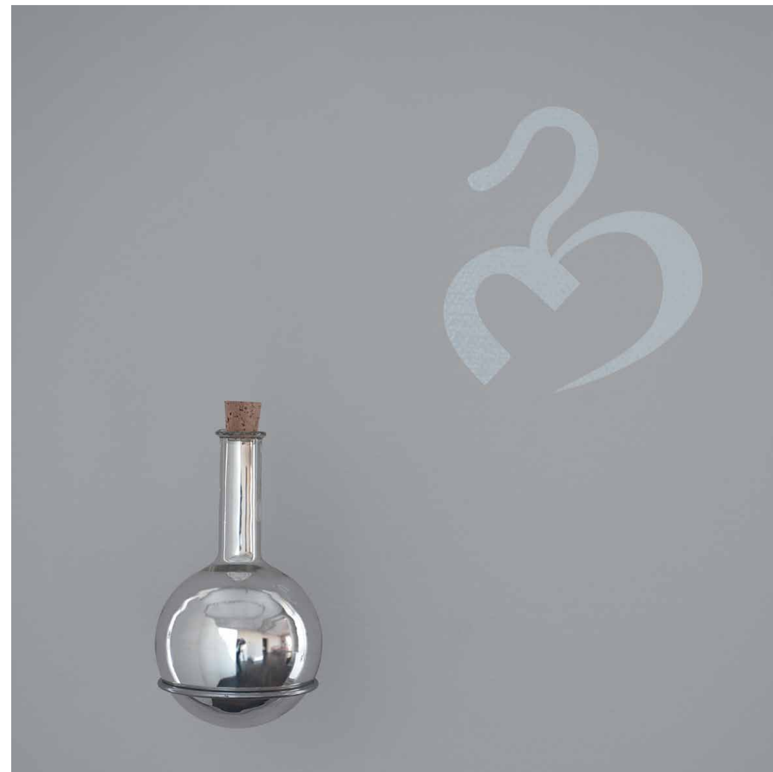
OPPOSITE · Roberto Ekholm CASE STUDY #34 (PRANA) , 2014 Found lab glass, aluminium oxide, cork, steel and vinyl 25 × 25 × 11 cm (9⅞ × 9⅞ × 4⅜ in.)